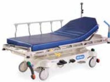
Hill-Rom Transport Stretcher