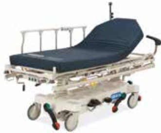
Hill-Rom Electric Stretcher**