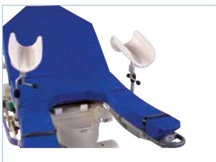
Telescopic Calf Supports**