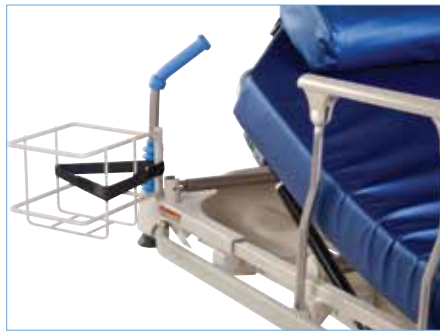
Liquid Oxygen Tank Holder P273