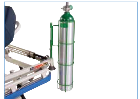
Vertical Oxygen Tank Holder P27603 Mounts in IV sockets to raise the supply tank.