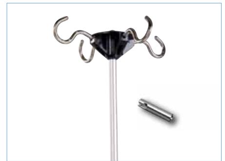
ISS Transfer Pole (socket adapter P163 required) P158 Socket Adapter P163