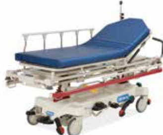
Hill-Rom Trauma Stretcher

All Hill-Rom Stretchers have a Safe Working Load of 318 kg