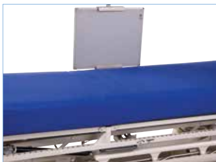
Lateral X-Ray Cassette Holder P264