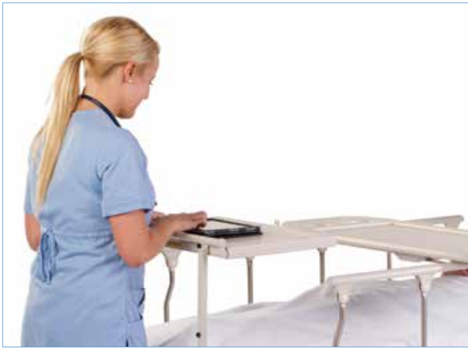
Convertible Footboard P350CTM07 (footboard, monitor shelf, extender) This versatile footboard can be used as a footboard, shelf or bed extender.