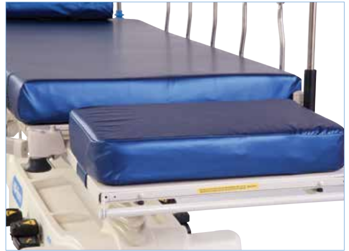
Foot Extender Pad (requires P350T) 7.62 cm P929G1 10.16 cm P929G2