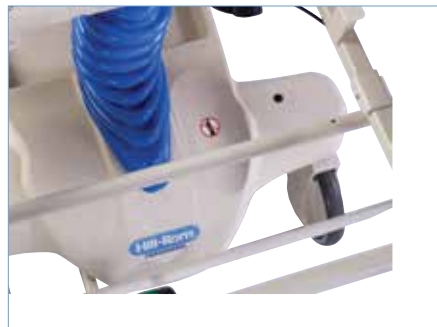
Paper Roll Dispenser standard width: 66.04 cm P364AT01 wide width: 76.2 cm P364AT02