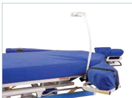
Gas Delivery/Drape Support Device**