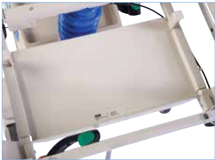
Utility Tray standard width: 66.04 cm P297B01 wide width: 76.2 cm P297B02