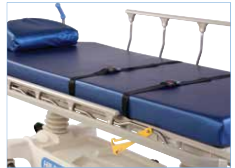
Transport Strap P349