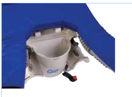
Detachable Catch/Fluid Basin**