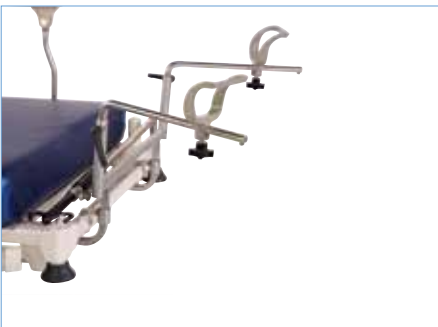
Ankle Stirrups P347AT Folds away when not in use.