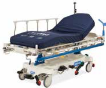
Hill-Rom Procedural Stretcher Optional safety siderails are available