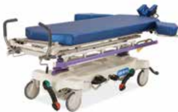
Hill-Rom Surgical Stretcher**

All Hill-Rom Stretchers have a Safe Working Load of 318 kg