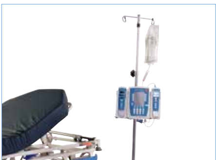
IV Transporter Device P491