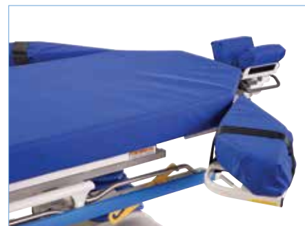
Integrated PACU Extenders**