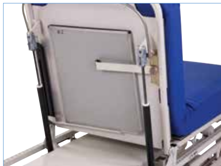
Upright Chest X-Ray Cassette Holder P279AT