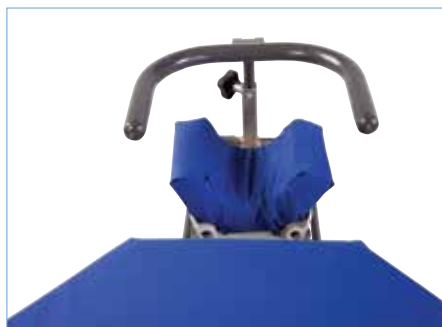
Superior Wrist Rest**