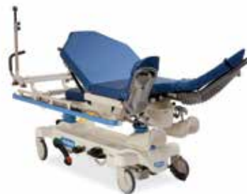
Hill-Rom OB-GYN Stretcher**